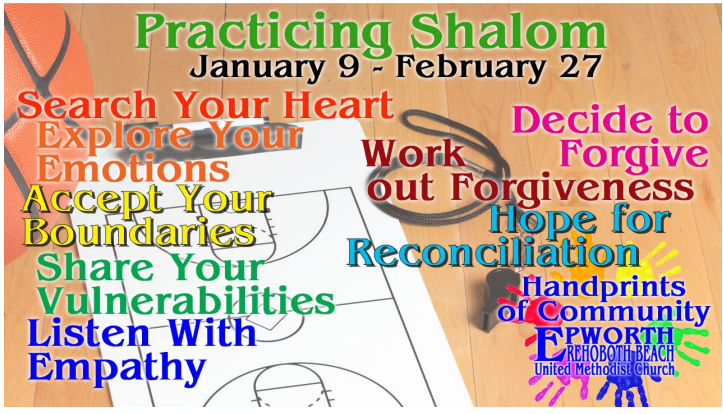
Back to <u>Table of Contents</u>